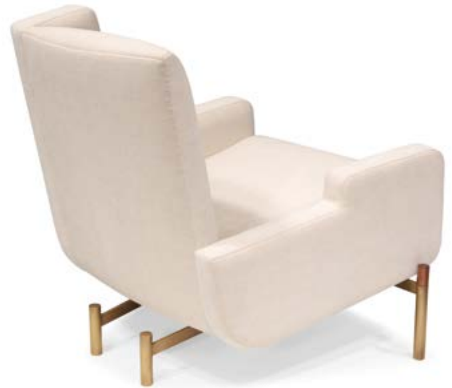
Patinated brass / glossy varnish-finished solid mutenye wood / structure and cushions upholstered in fabric Laiton patiné / mutène massif verni brillant / structure et coussins recouverts de tissu 880 x 850 x 860mm