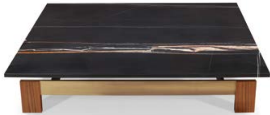
Patinated brass / glossy varnish-finished solid mutenye wood / sahara noir marble Laiton patiné / mutène massif, vernis brillant / marbre sahara noir 1200 x 1300 x 260mm