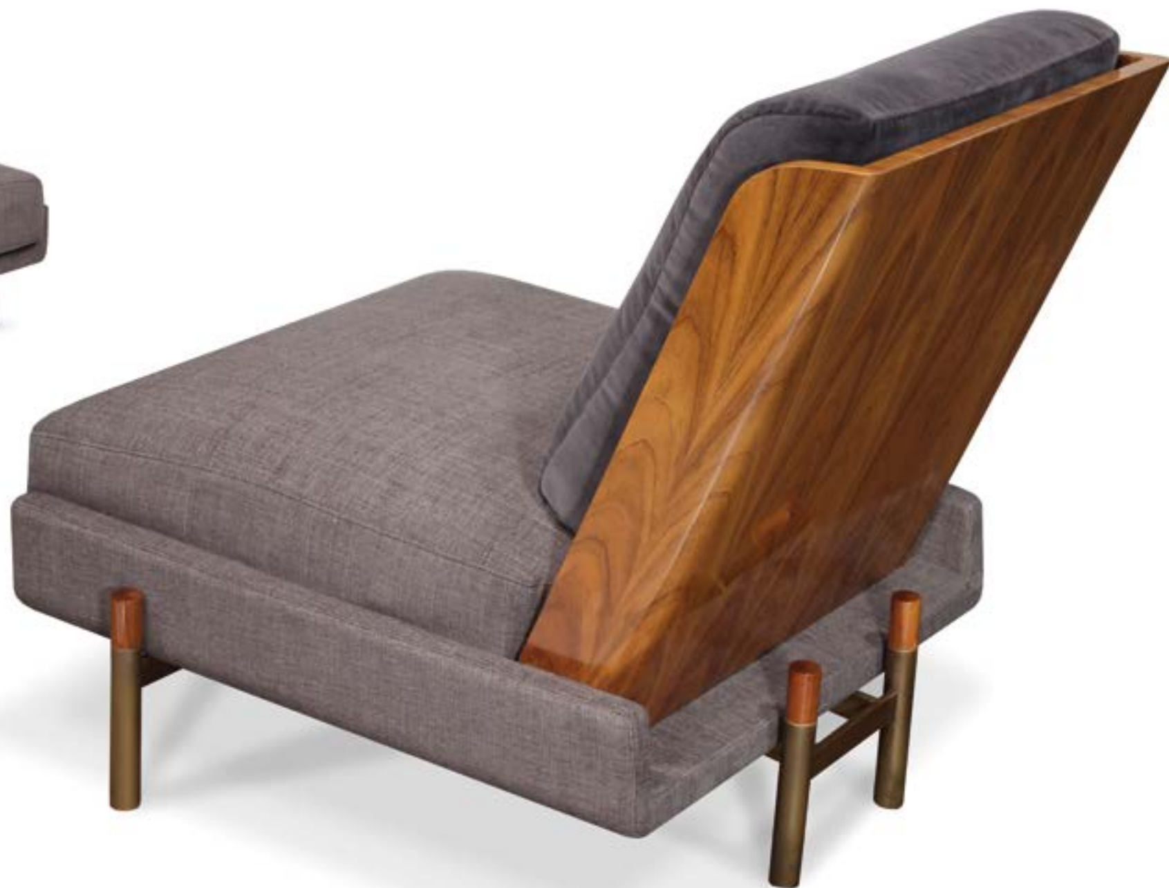
Glossy varnish-finished veneered and solid mutenye wood / patinated brass / seat and back cushions upholstered in fabric Mutène massif et plaqué, vernis brillant / laiton patiné / coussins recouverts de tissu 840 x 820 x 770mm