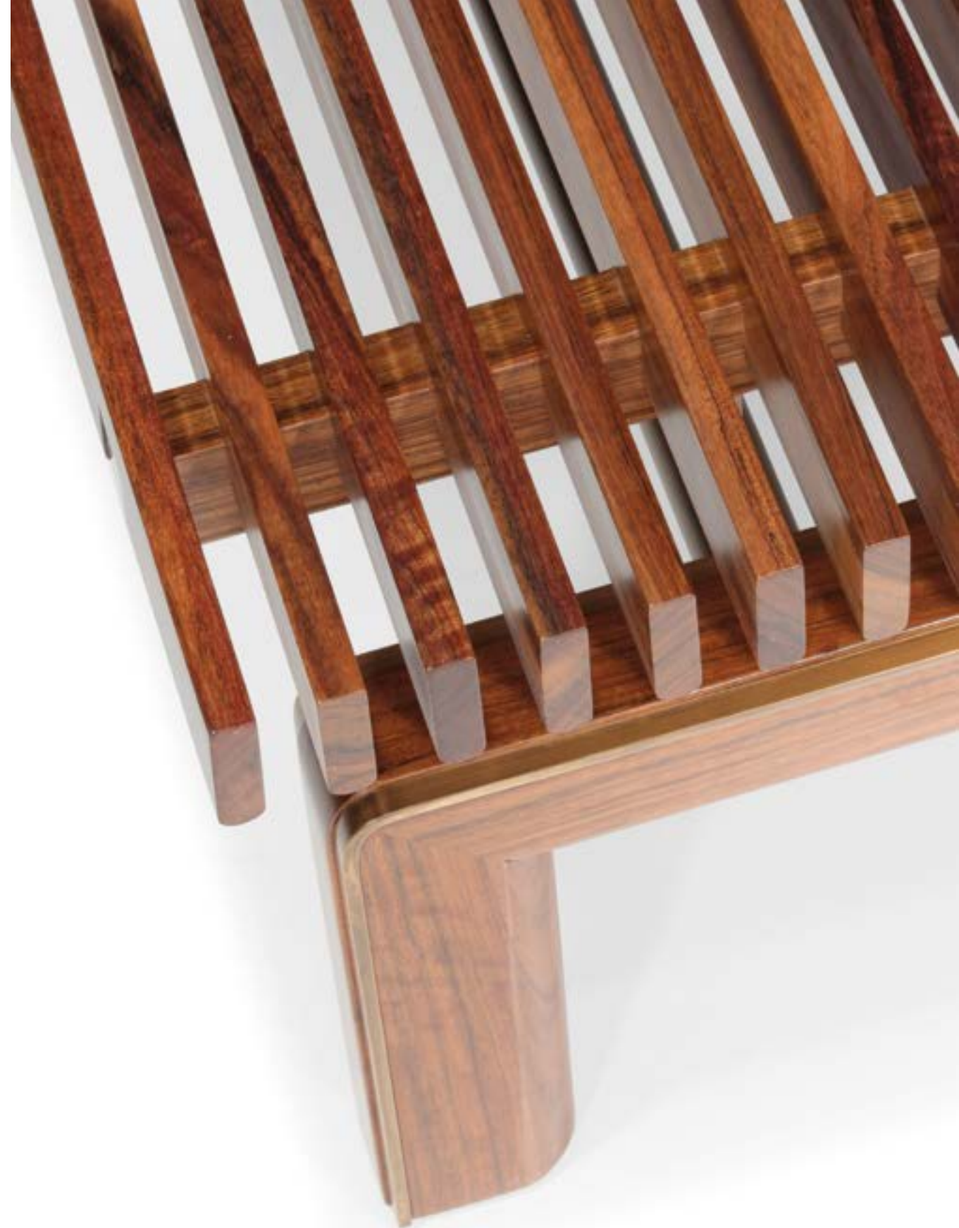
Satin varnish-finished solid mutenye wood / patinated brass Mutène massif, vernis satiné / laiton patiné 1700 x 700 x 375mm