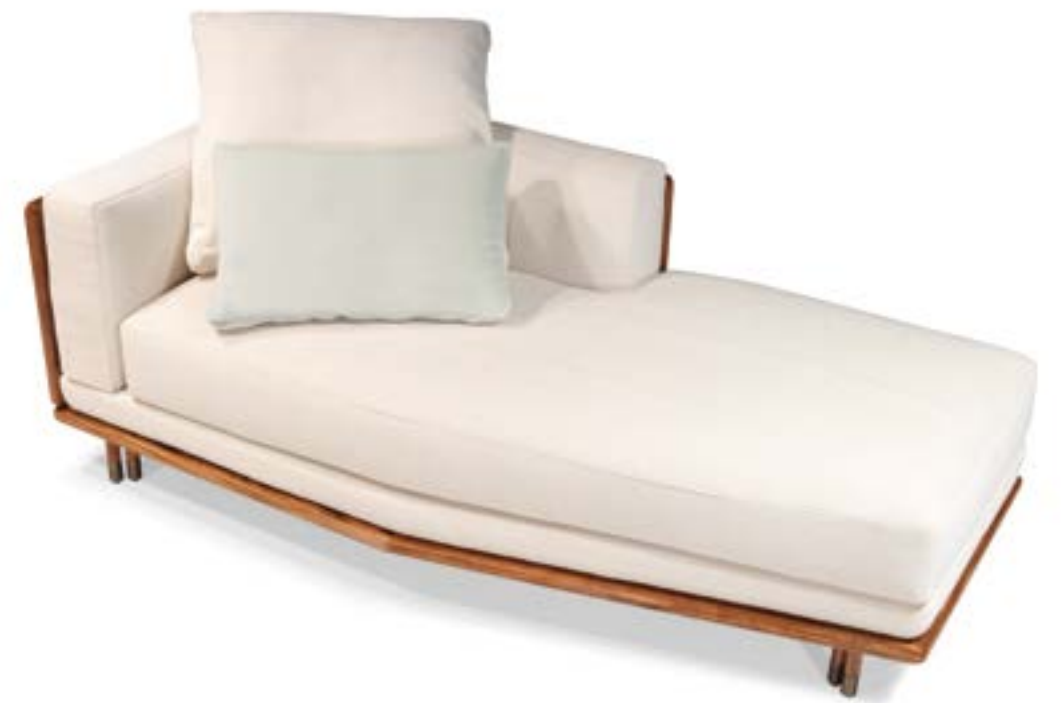
Glossy varnish-finished solid mutenye wood / patinated brass / natural rattan / seat and back cushions upholstered in fabric Mutène massif, vernis brillant / laiton patiné / rotin naturel / coussins recouverts de tissu 2000 x 1050 x 700/880mm