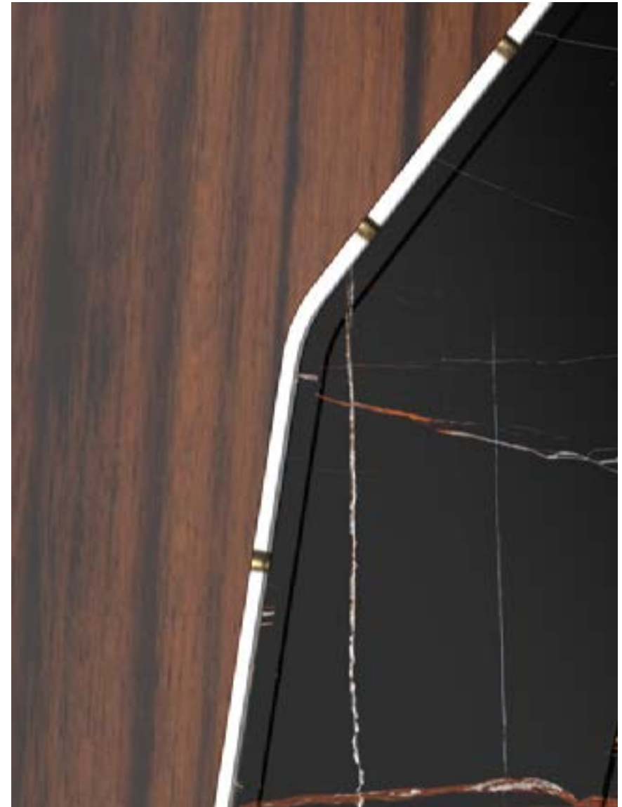
Glossy varnish-finished veneered mutenye wood / patinated brass / sahara noir marble Placage mutène vernis brillant / laiton patiné / marbre sahara noir 1840 x 850 x 365mm