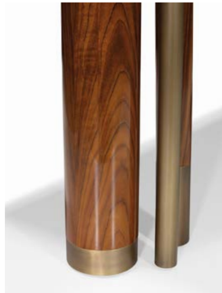
Glossy varnish-finished veneered mutenye wood / patinated brass / glossy lacquer-finished top Placage de mutène, vernis brillant / laiton patiné / laque brillante 2230 x 1100 x 750mm