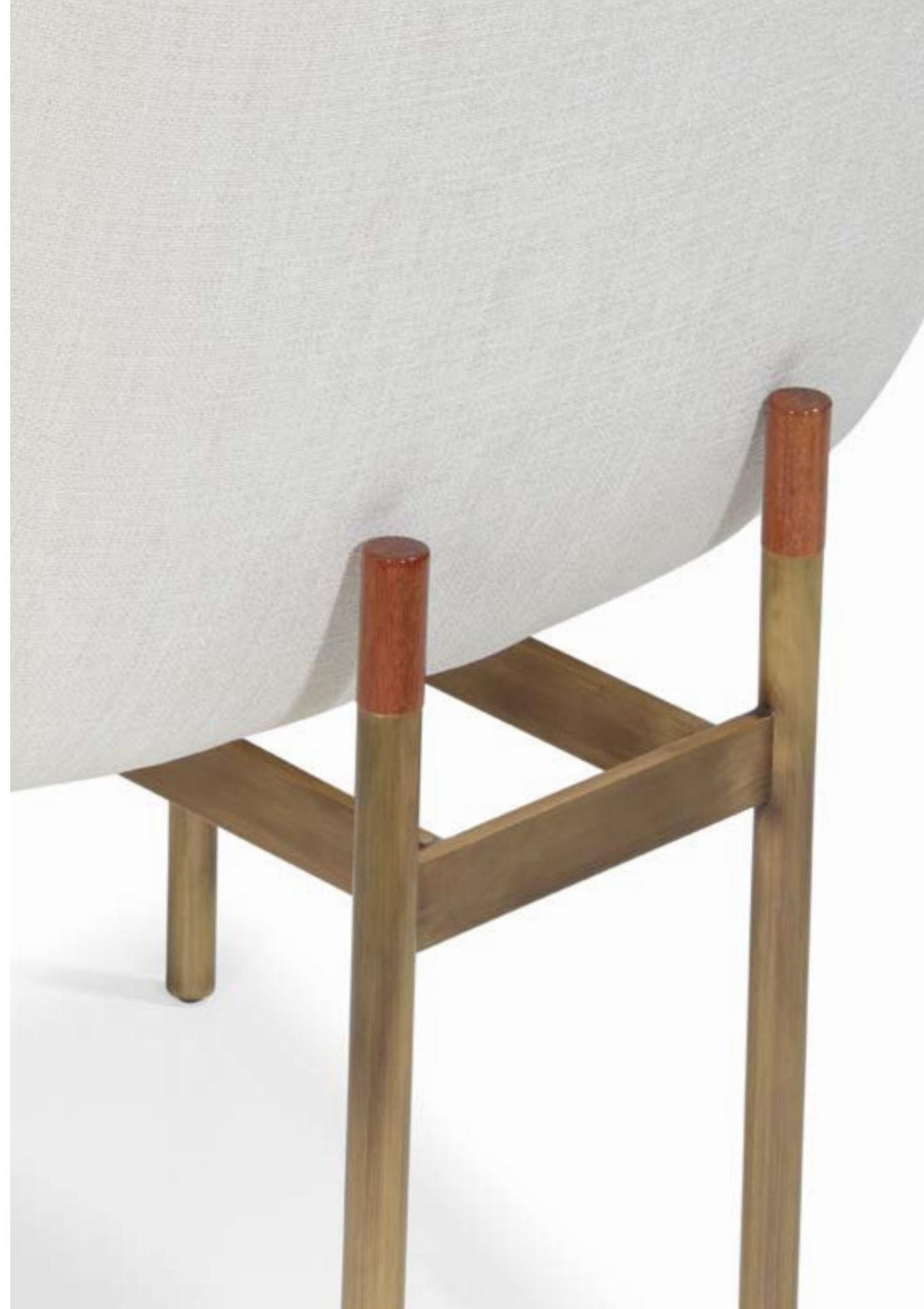
Patinated brass / glossy varnish-finished mutenye wood / polyurethane shell upholstered in fabric Laiton patiné / mutène massif verni brillant / coque polyuréthane recouverte de tissu 610 x 630 x 800mm