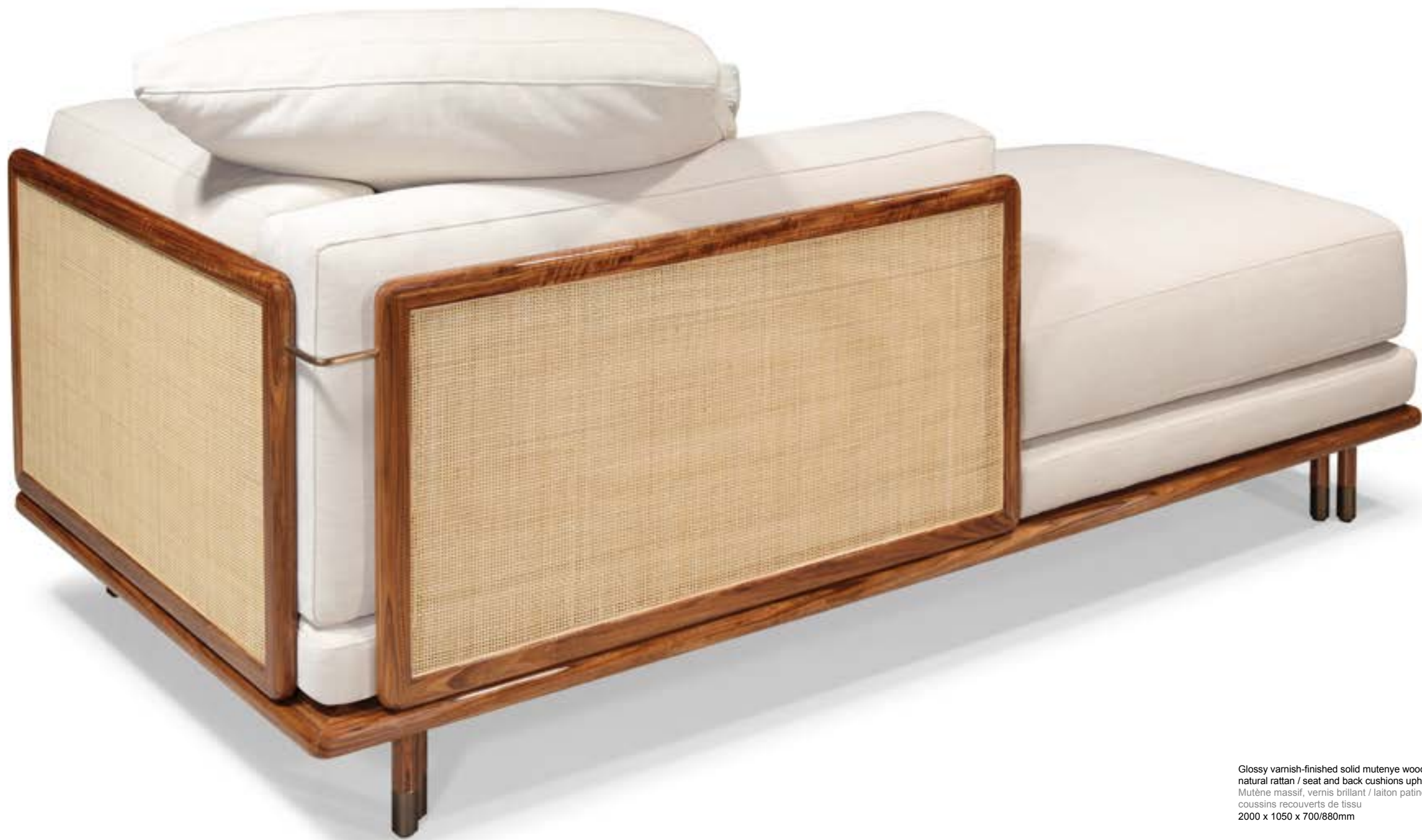
Glossy varnish-finished solid mutenye wood / patinated brass / natural rattan / seat and back cushions upholstered in fabric Mutène massif, vernis brillant / laiton patiné / rotin naturel / coussins recouverts de tissu 2000 x 1050 x 700/880mm