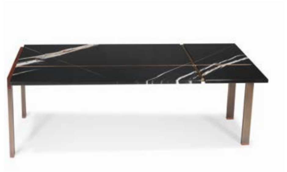
Patinated brass / glossy varnish-finished solid mutenye wood / sahara noir marble Laiton patiné / mutène massif, vernis brillant / marbre sahara noir 1315 x 600 x 445mm